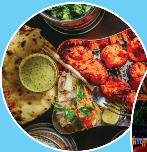
The Spice Route is located within the incredible fancy Swahili Beach resort

If you're craving for a deliciously spiced Indian meal, then head to Spice Route. A reservation is mandatory, so we can help you with this. And just around the corner, we recommend Diani Backpackers for a drink and a dance during the weekend!